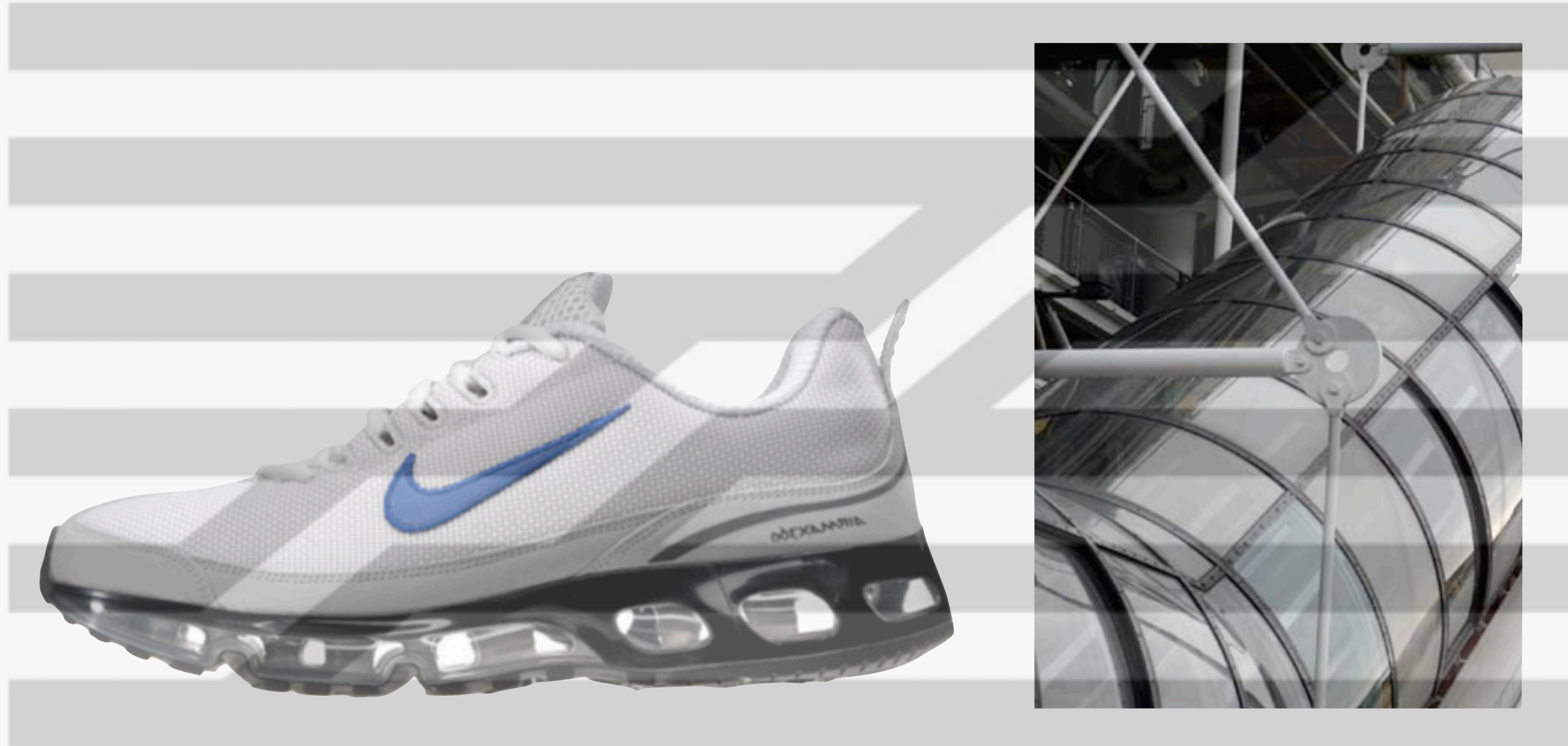
Nike Air —[VaporMax Integrated Heel and Sole / Centre Pompidou External Escalator, Paris