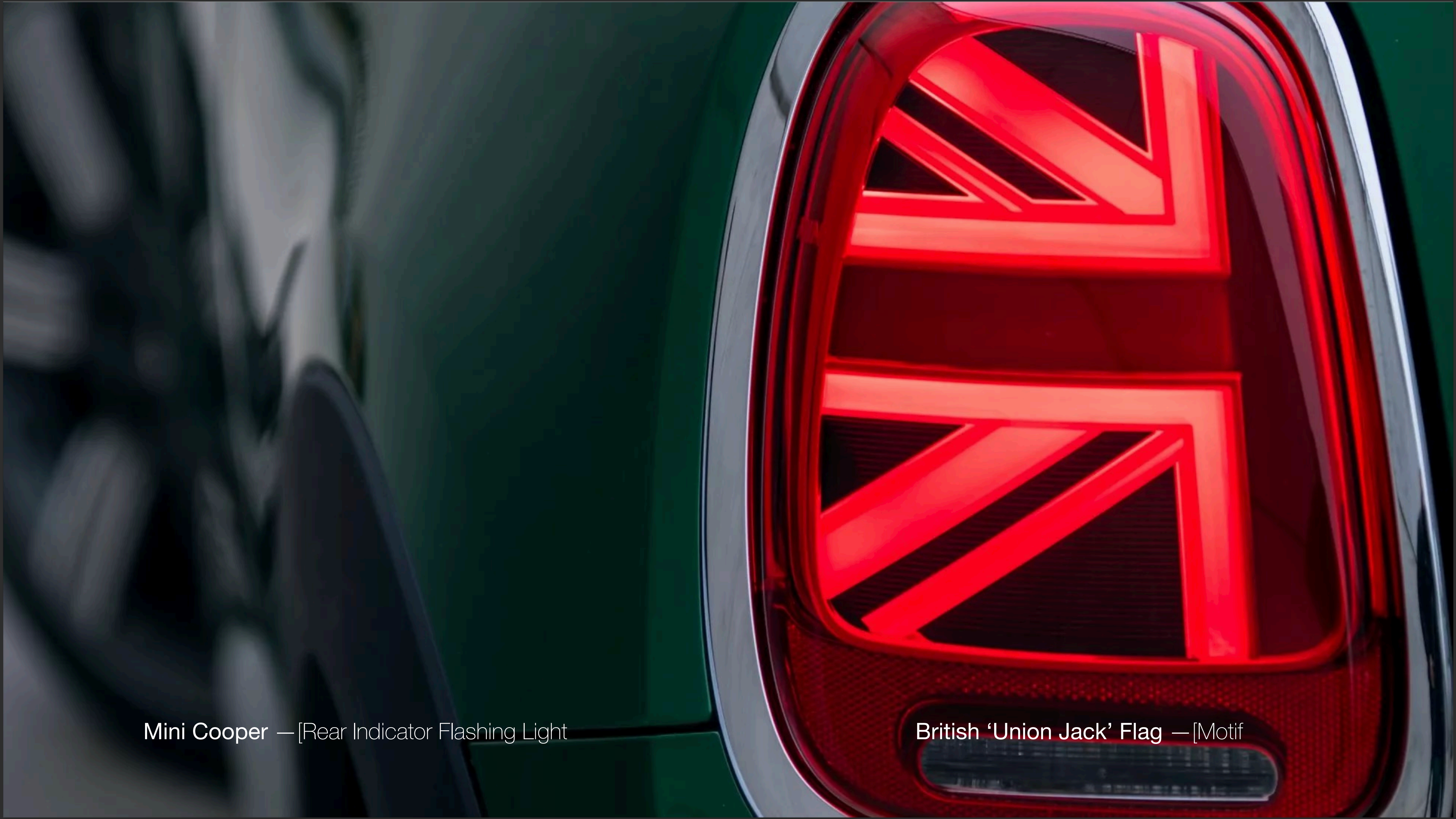
Mini Cooper — [Rear Indicator Flashing Light