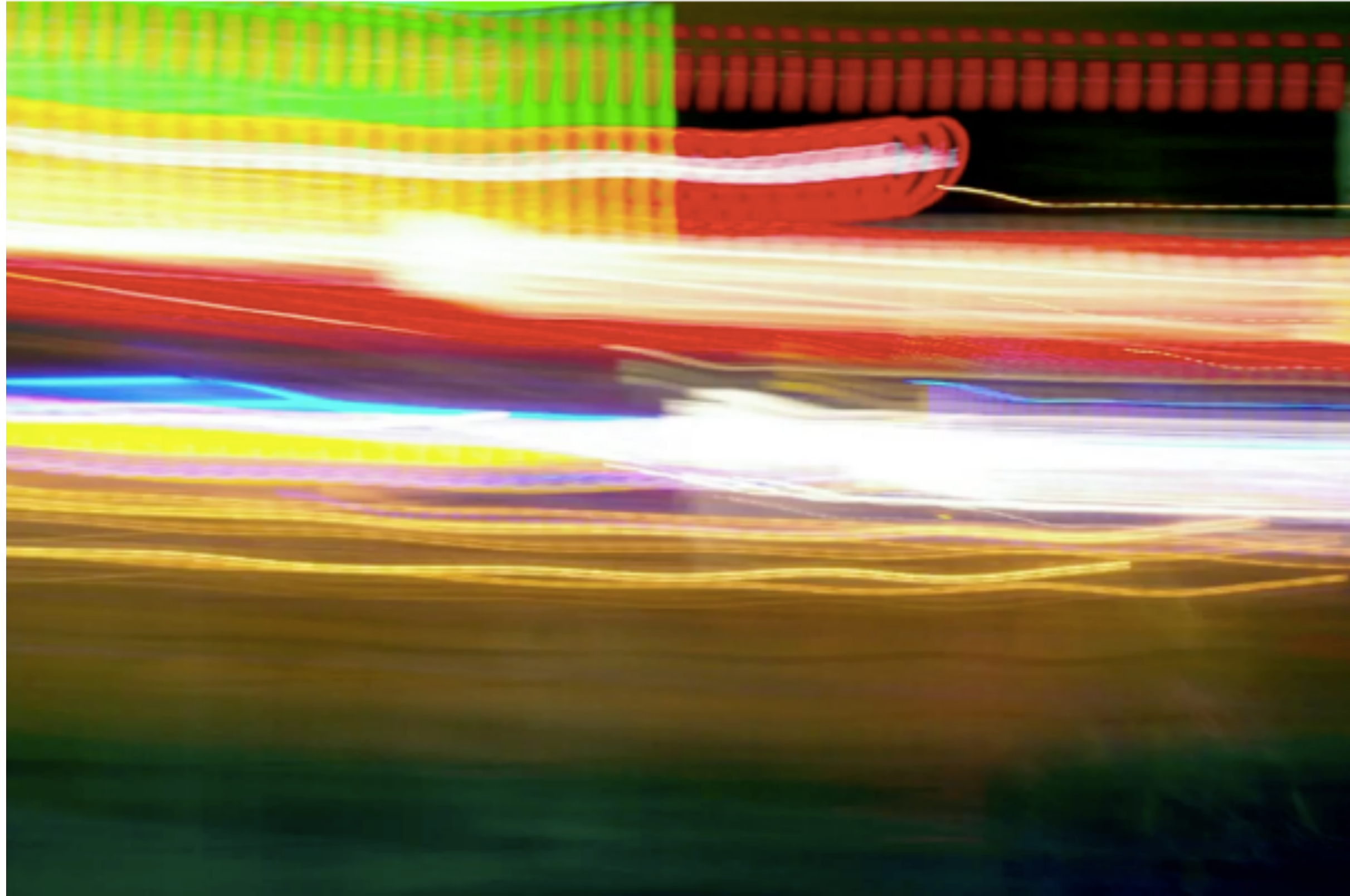
Inspiration]—Time Delay Photo of Car Headlights / Paul Smith Scarf