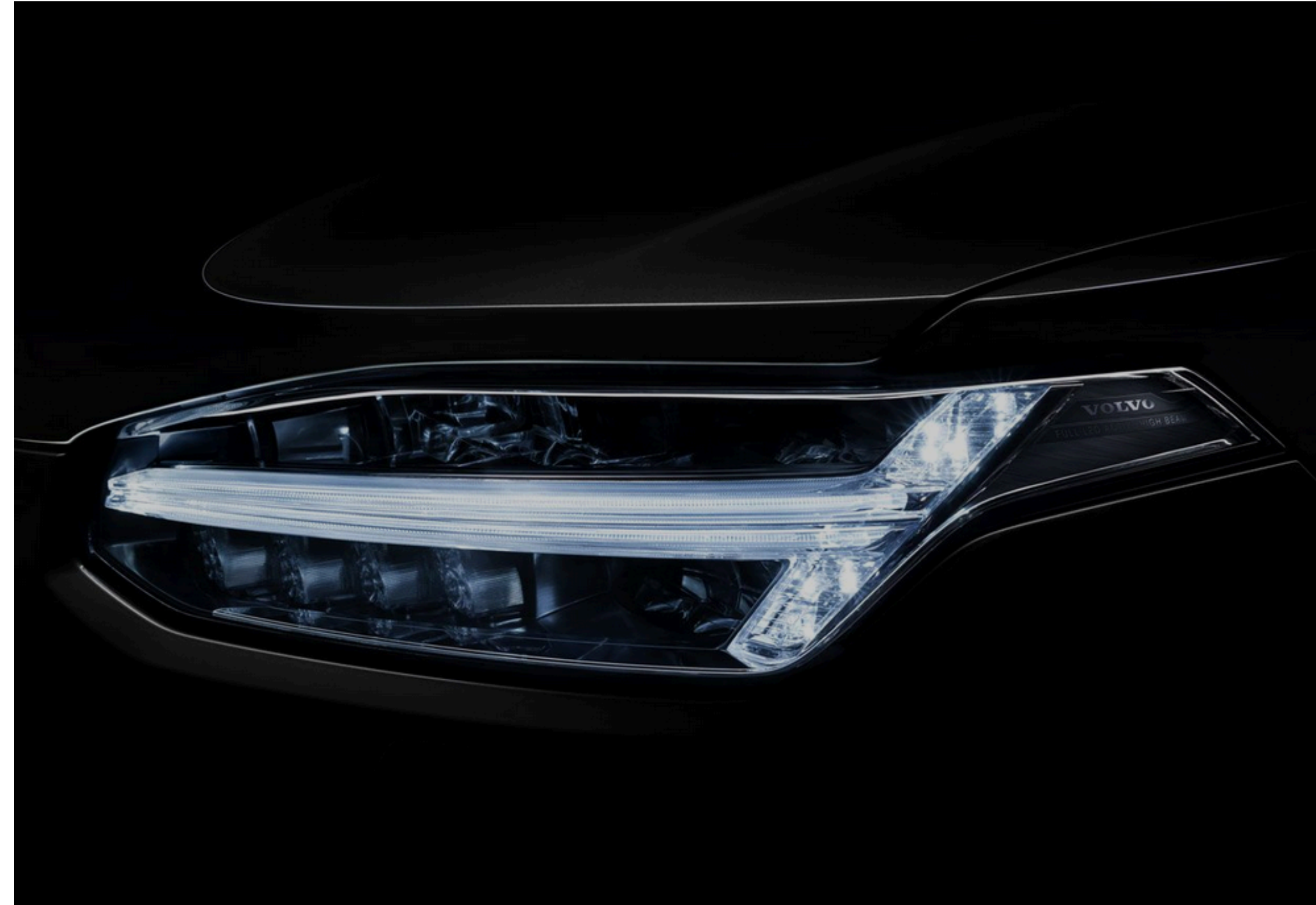
Volvo LED Daytime Running Light in the Headlights