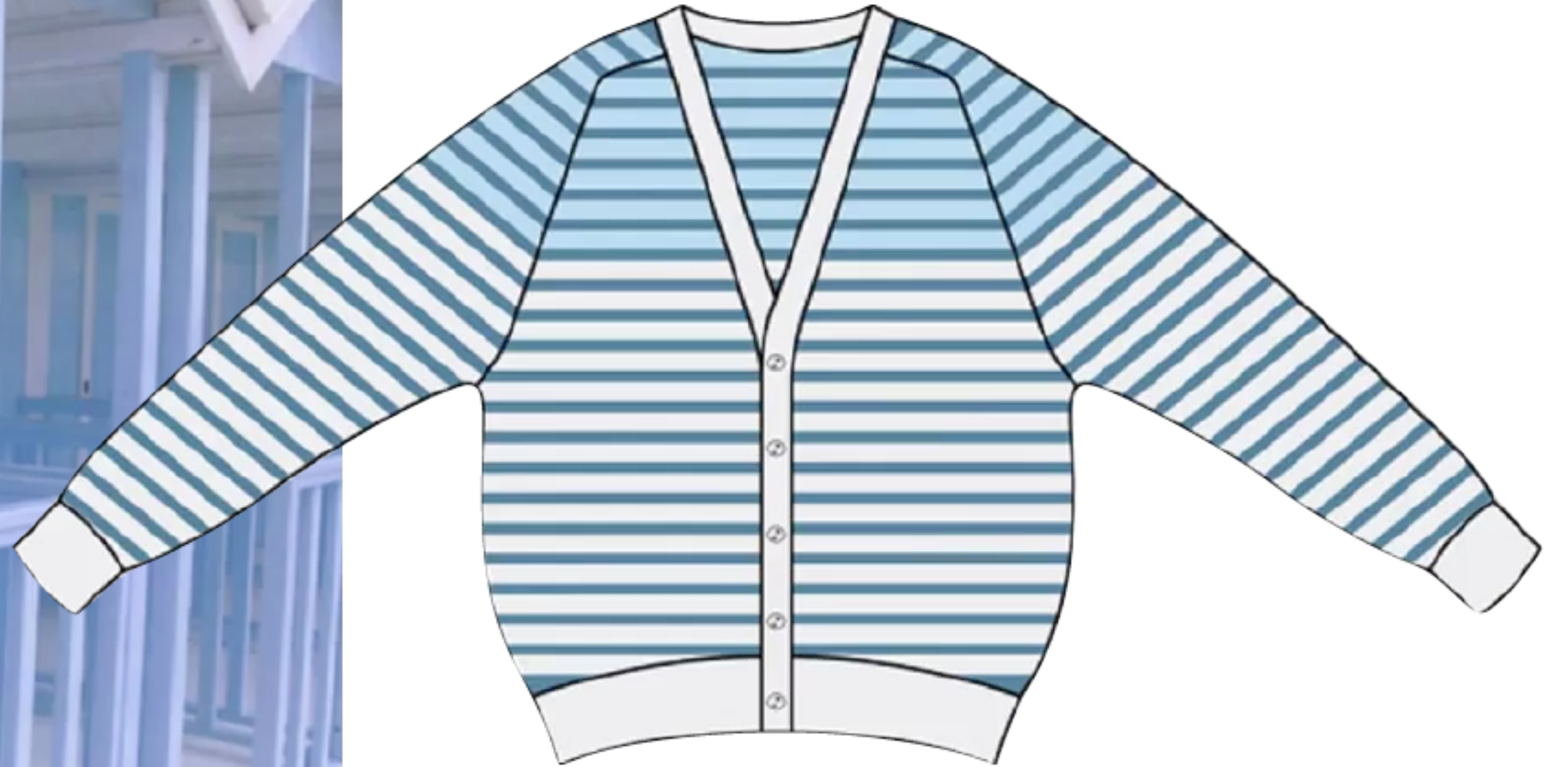
Inspiration]— Beach Hut / Paul Smith Sweater