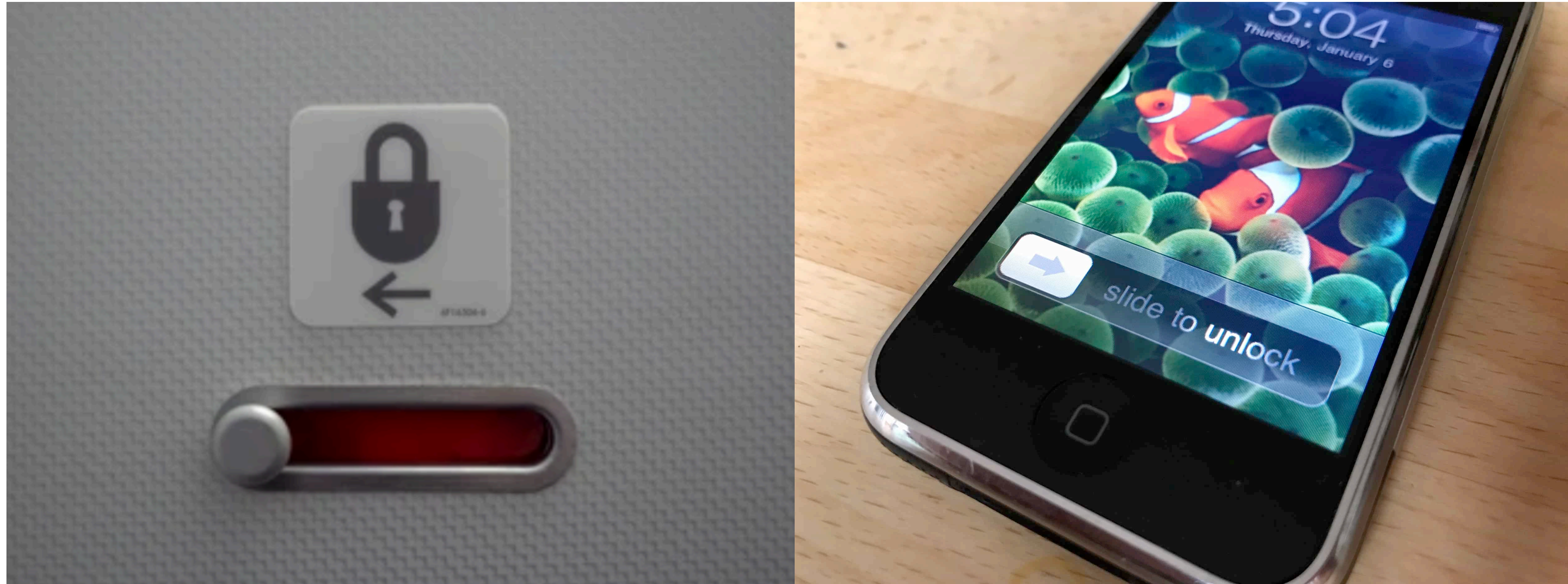
Aircraft Toilet Door Lock & Unlock Mechanism — Apple iPhone Slide-to-Unlock Interactive Behaviour and Assistive Capability Feature