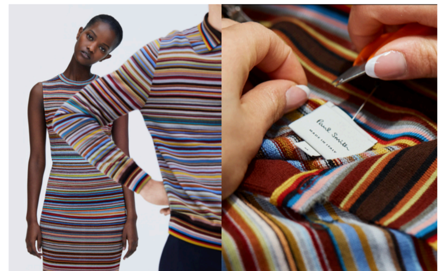
Paul Smith 'Signature' Stripe