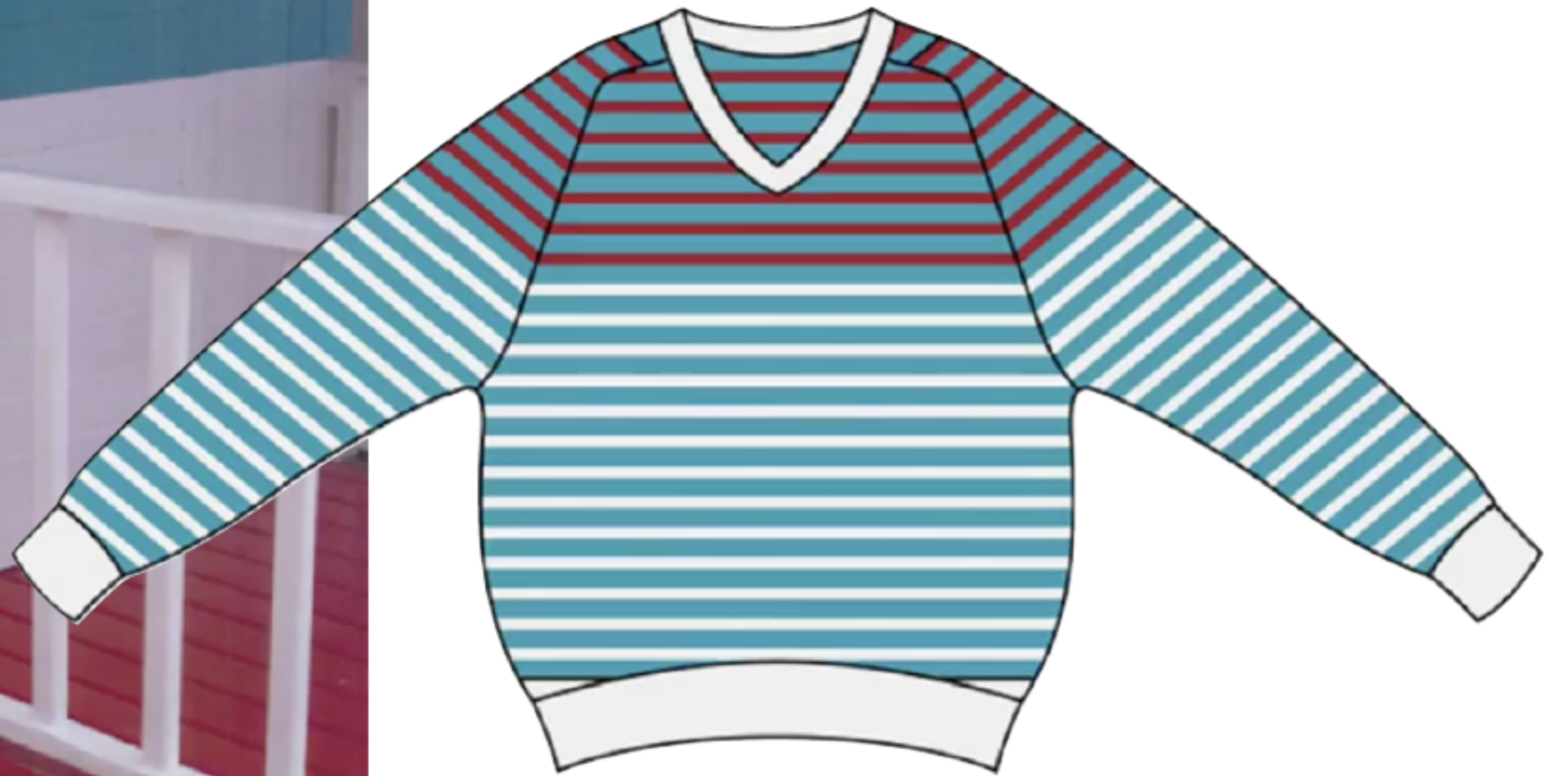
Inspiration] — Beach Hut / Paul Smith Sweater