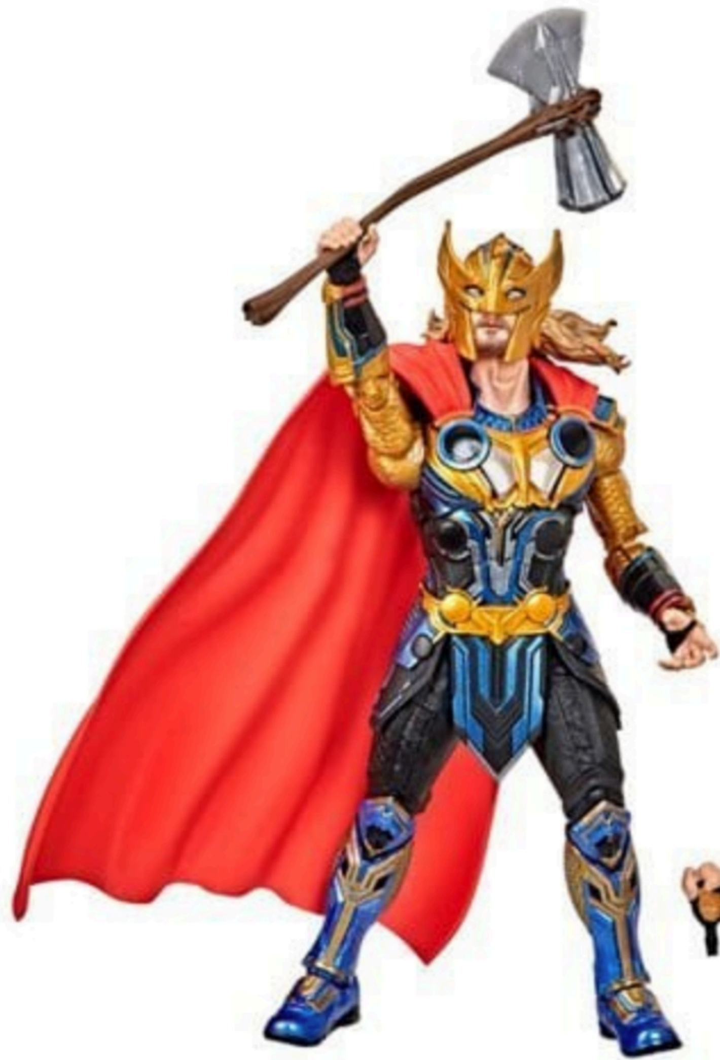
Marval Figure Thor / Axe