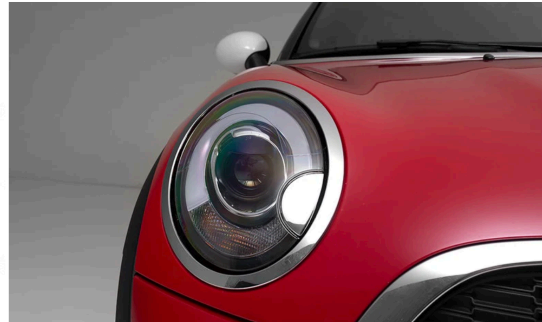
Mini Cooper —[Car Headlight