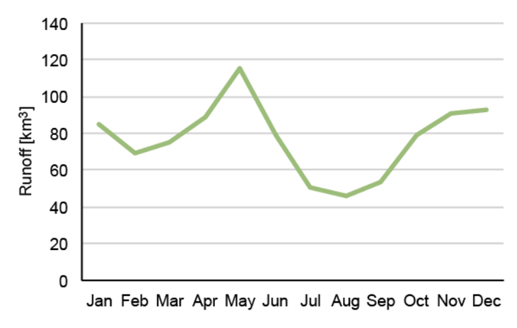
Figure 2. Total monthly runoff in Fennoscandia.

Figure 1 shows that runoff is fairly low during the winter months in most of Finland and Sweden, apart from the very southern areas. This is most likely due to most of rainfall coming as snow that stays on the ground. The consequences of this are clearly seen in April–June, when snowmelt visibly increases runoff. The month-by-month variation can also be detected from Figure 2, which presents the total monthly runoff in all of Fennoscandia. Runoff is fairly low in January–March, and then peaks in May, followed by lower runoff during the summer months.