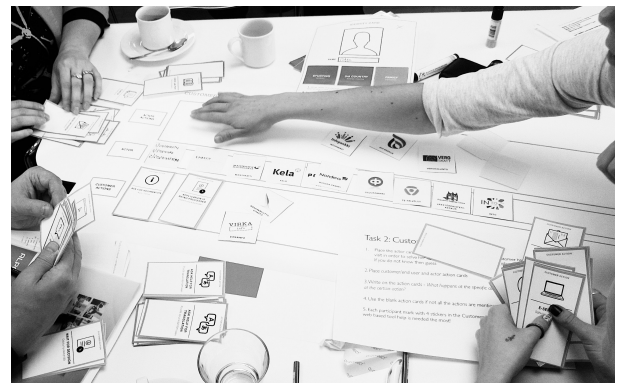
Figure 2: User service journey and users' action cards enabled zooming into an individual person's interaction with a service.

The first example is from a workshop that aimed at defining the service providers' and end-users' actions, and describes a process of empathising with an individual in a service delivery context. The participants were given a customer service journey template, actor cards and actors' and end-users' action cards. The participants were asked to identify, on the one hand, actors and their actions needed for an individual service provider when serving an end-user, and on the other, to identify end-user actions required to achieve a service goal. These tools aimed to make sense of complex service actions on both sides - service providers and service users. In terms of context, the actor and the action cards served to make the entire customer journey more systematic and provided an opportunity to identify and discuss problematic journey points in order to seek solutions serving both sides (Figure 2).