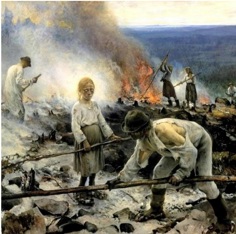
Eero Järnefelt (1893) Burning the brushwood