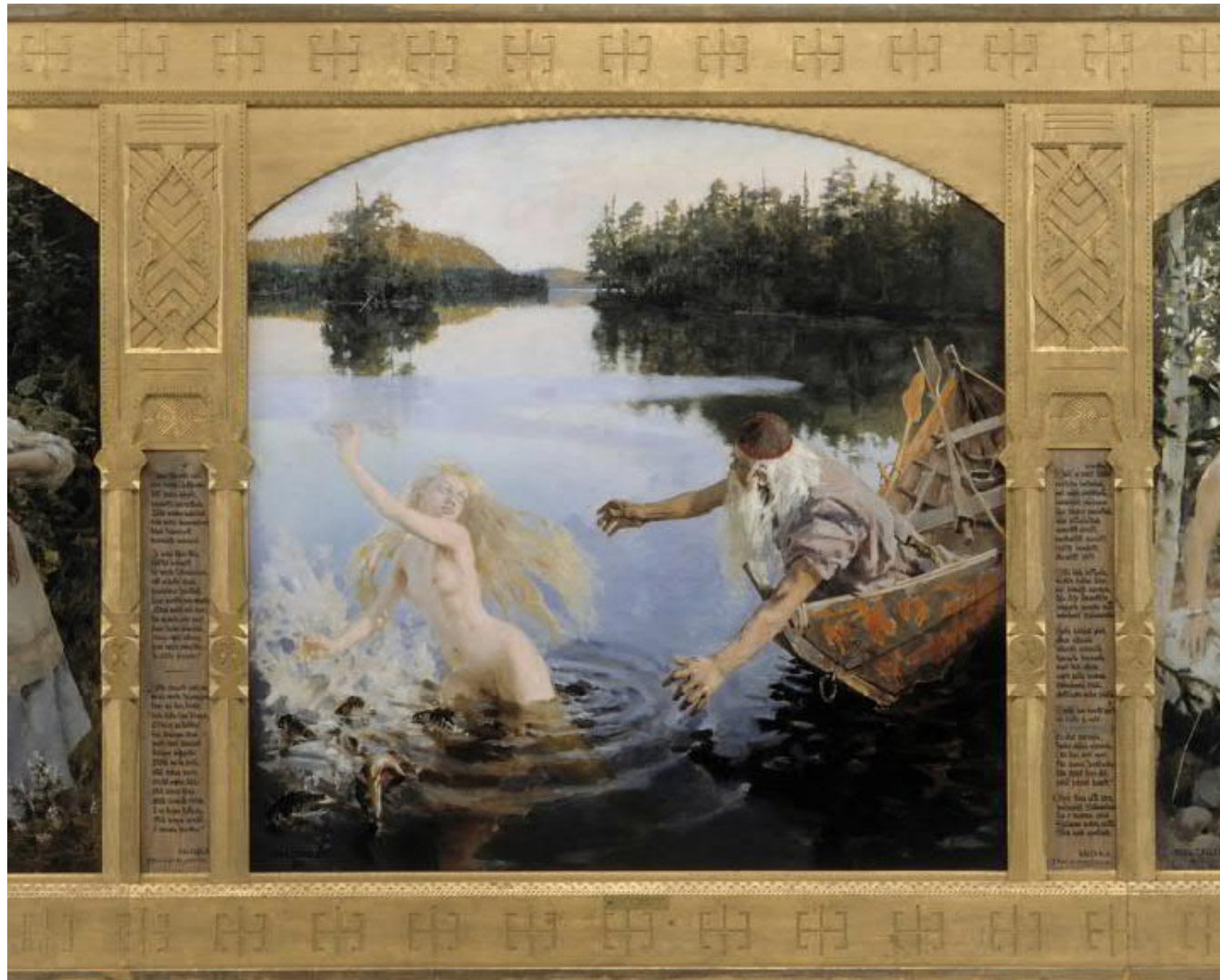
Akseli Gallén-Kallela 1891: Aino-taru / Aino Myth