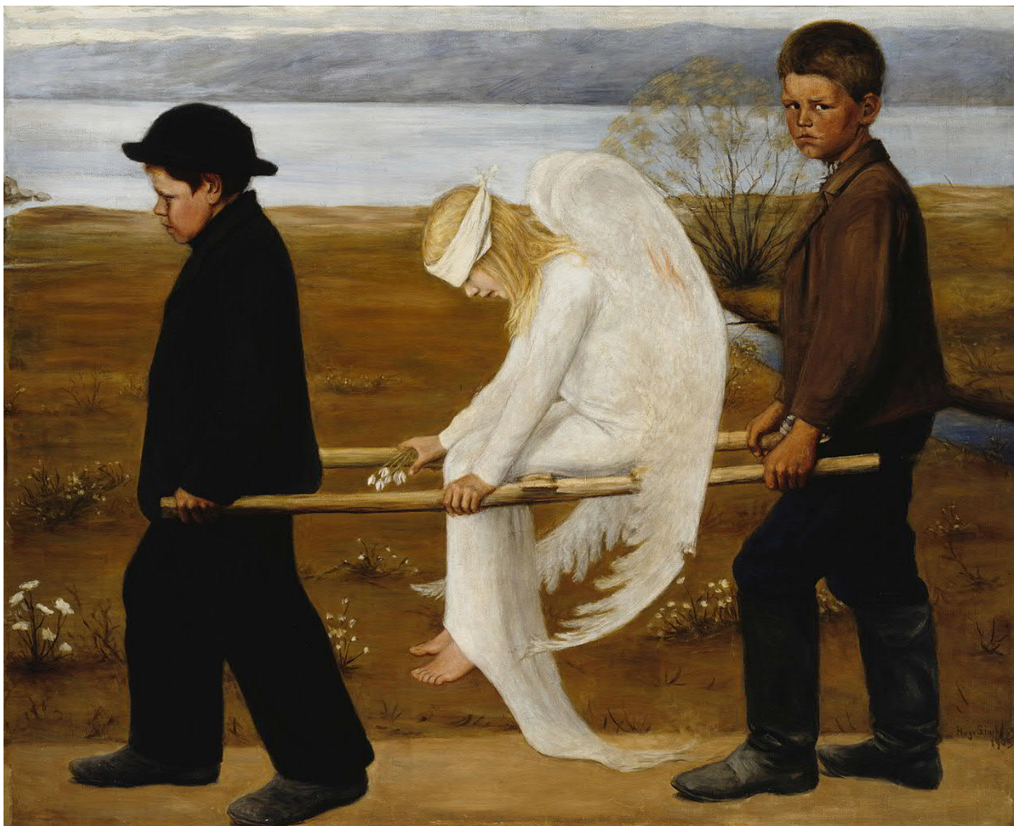
Hugo Simberg 1903: Haavoittunut enkeli / Wounded angel