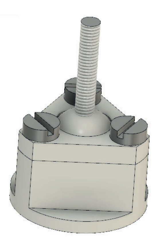
Model of the 3D printed ball joint.

AFP has a pan on a Stewart-Gough platform, which enables all necessary frying movement. Six telescope sticks with ball joints in the ends create six degrees of freedom to the frying pan.